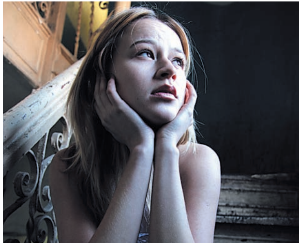
Gloomy days could lead to a gloomy disposition. If you suspect you suffer from seasonal affective disorder, consult your doctor.

SAD, which usually manifests itself in adults in their mid-20s and statistically affects more women than men, is marked by