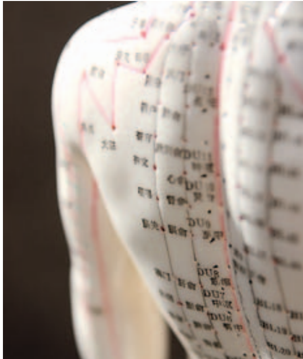
In the practice of acupuncture, there are seemingly endless points on the body that trigger certain types of stimulation to harmonize the body's energy flow, or qi (chi).

On a visit to Netzer's unsurprisingly serene office, the question increasingly became irrelevant once our hour together drew to a close. Beginning with a series of health and personal questions aimed at identifying my individual needs of and expectations from acupuncture, I